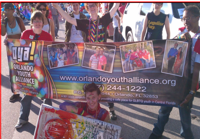
OYA Youth Members Marching in the Parade for Come Out With Pride 2011