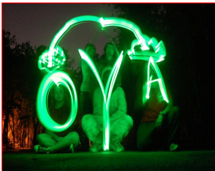
OYA Camping Trip