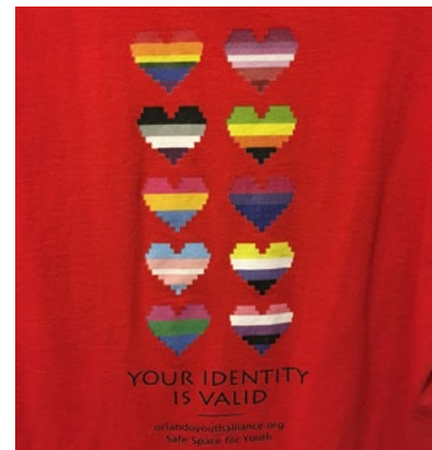
New OYA t-shirt designed by the youth

A member of SYA for years, finds his family evicted from their home with nowhere to live. Leadership of OYA meet with the parents and introduce them to resources they didn't know existed. OYA offers financial assistance to tie them over this bump. They signed a lease on a new place right before Christmas. Everyone is safe and healthy.