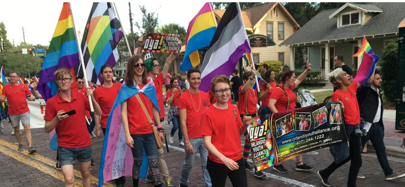
OYA youth marching in Come Out With Pride parade

Exactly five (5) months after the largest mass shooting in American history, 150,000 people from across the world gathered in Orlando to celebrate Orlando Pride and honor the lives of the 49 victims. OYA participated in the event by both marching in the parade and by hosting a booth at Lake Eola. Approximately 700 interested youth stopped by our booth and received information on OYA and our mission. Following the Pulse massacre, interest in the organization has increased as youth look for ways to cope with increased anxiety and fear. But Orlando Pride was an opportunity for the youth of OYA to come together and celebrate who they are and everything we have in common.