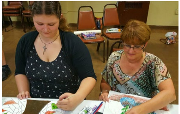
Art therapy after Pulse

To the right is a photo of the artwork created by our youth. It is made up of broken colored glass. Their message is "even when things are broken we can find beauty".