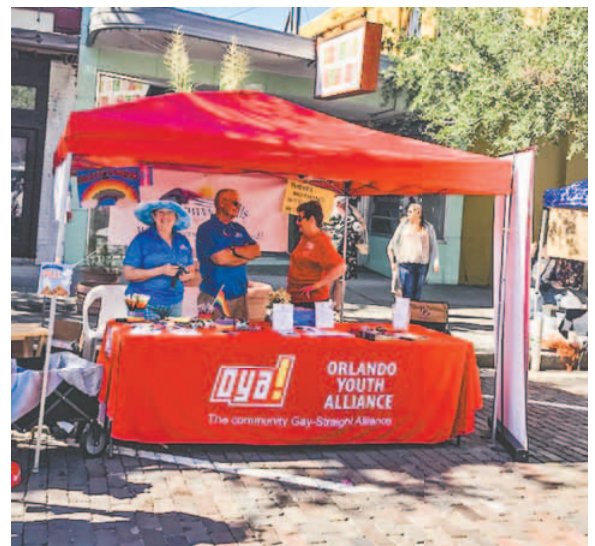
OYA Booth at Seminole Pride