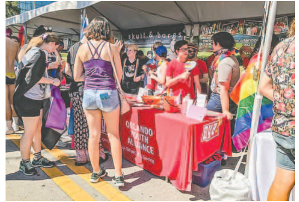
OYA Booth at Come Out With Pride