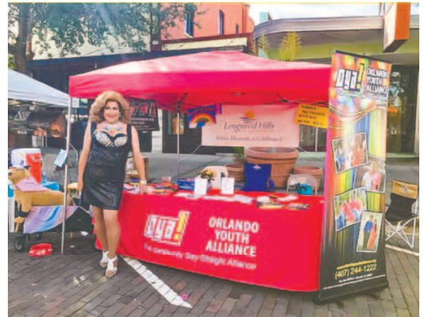
OYA Booth at Sanford Pride